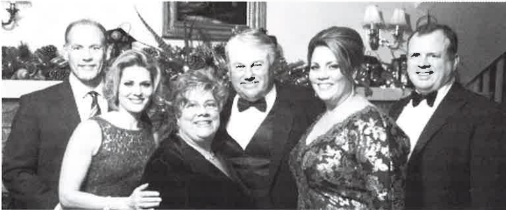
Last year over 275 guests celebrated good times, with good friends, at the 2013 West Chester Charity Ball.