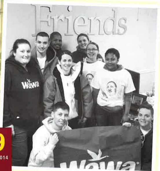
Wawa, Inc. volunteers at Friends Association offices

4,189 VOLUNTEER HOURS IN 2014 711 VOLUNTEERS