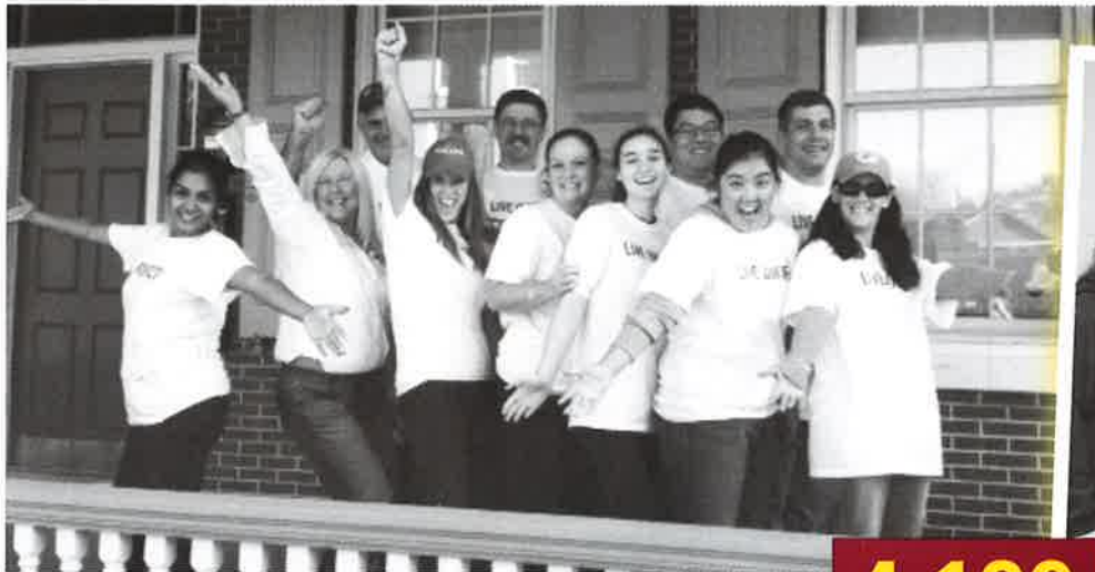
Ricoh Americas Corporation volunteers at Emergency Family Shelter