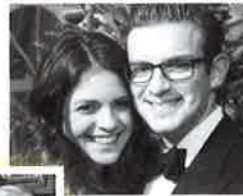
The portraits were at West Chester Golf & Country Club on December 6, 2014.

We rely on generous contributions from donors like you to provide shelter and support to homeless, or near-homeless families. Save the date! Next year's West Chester Charity Ball will be December 5, 2015 . ☀